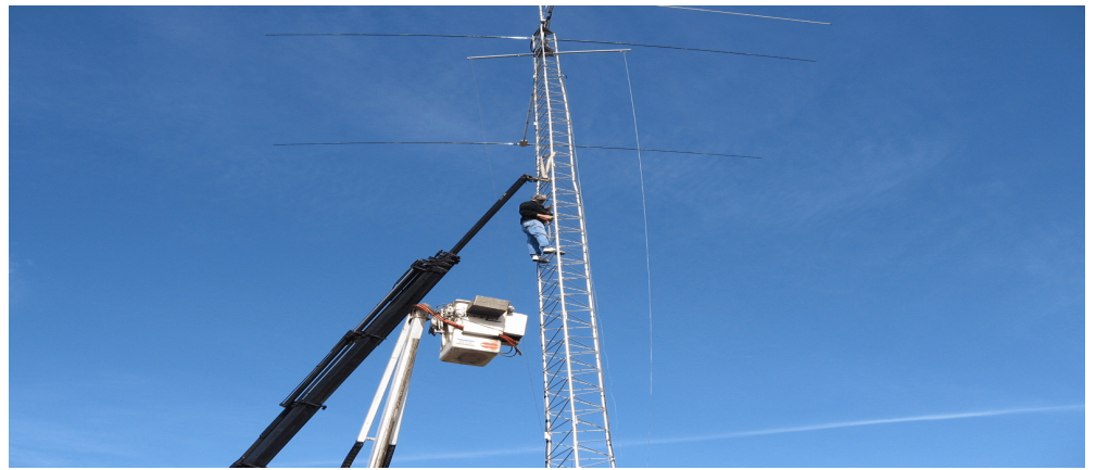
Tom removes the sling