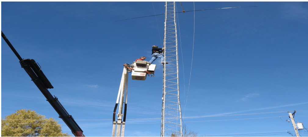
Tom to the Rescue